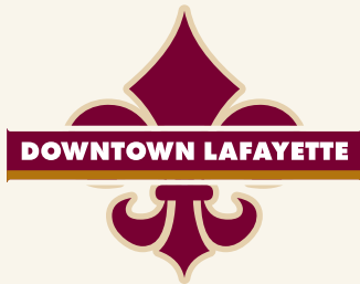
Where Lafayette Happens.

THE GOAL FOR ANY COLOR USAGE IS TO MATCH THE COATED PMS CHIP. THE UNCOATED PMS AND CMYK VALUES LISTED HERE GIVE THE CLOSEST EQUIVALENT. THEY ARE MEANT TO BE A STARTING POINT AND MAY NEED TO BE ADJUSTED TO OBTAIN THE CLOSEST MATCH POSSIBLE TO THE COATED PMS CHIP.