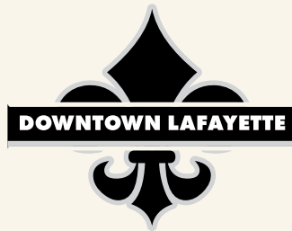
Where Lafayette Happens.