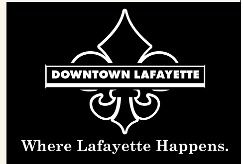
Where Lafayette Happens.